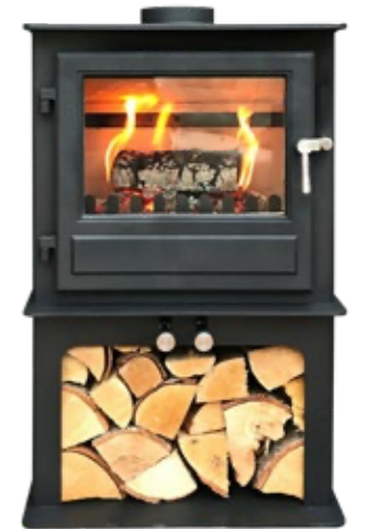
Black & Stainless Steel Log Box Option